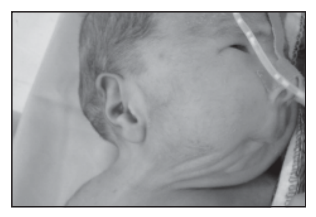
Fig.-2: Micrognathia, pterygium of neck (webbing)