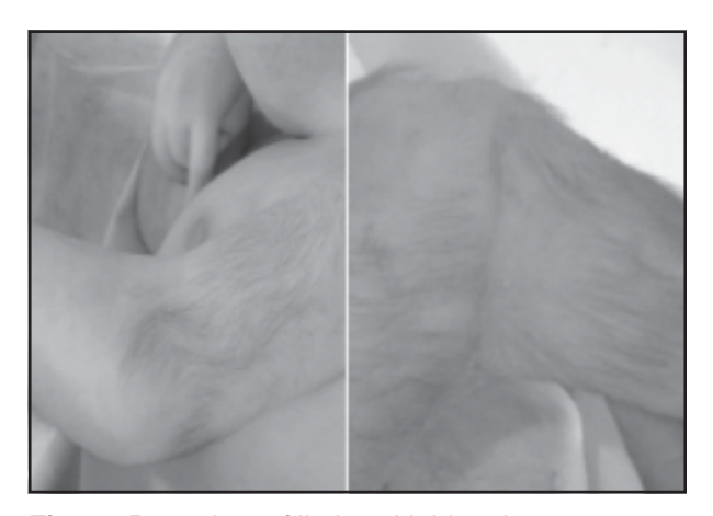
Fig.-3: Pterygium of limbs with hirsutism

There was bilateral flexion deformity of the elbow, wrist, knee and ankle joints and webbing across all flexion creases (Figure-3,5). She also had camptodactyly of all fingers and toes. She had scoliosis, contracted pelvis and both feet had a rocker bottom appearance. All her nails were normal. On genital examination her labia majora were rudimentary on right side, normal labia minora and introitus were present. No abnormality could be detected in respiratory, gastrointestinal or central nervous system examination. A continuous machinery murmur was audible in left 2<sup>nd</sup>intercostals space. She had average birth weight (2.6 kg) and OFC (35 cm).