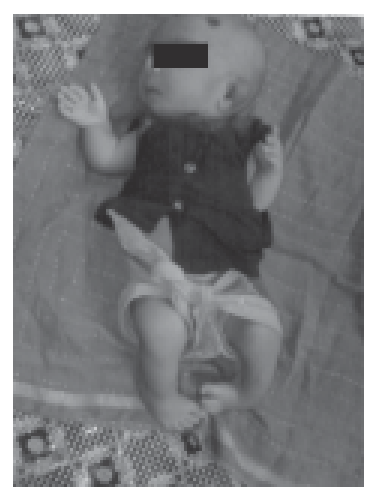
Fig.-1: Infant showing swelling on ear with club feet

normal. Her arms and forearms were short with ulnar deviation. Hitchhiker thumb was absent. Lower limbs were also short with bilateral talipes equinovarus (club foot)(Fig:-1). Flexion deformity was observed at knee and elbow joints. Hip joints, back and spine appeared normal. Other systems including heart and lungs revealed normal. Her routine hematological