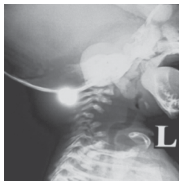
Fig.-2: Hypoplastic c_5 to c_7 cervical spines:

investigations were normal. There was hypoplasia of C_5 to C_7 vertebra and a gap in lamina of C_5 and C_6 level was seen (Fig:-2). Dorsolumbar spine was normal. X-ray of both hands revealed radial curvature with metaphysial widening of radius (Fig:-3). The baby was managed that time through routine care along with counseling of mother.